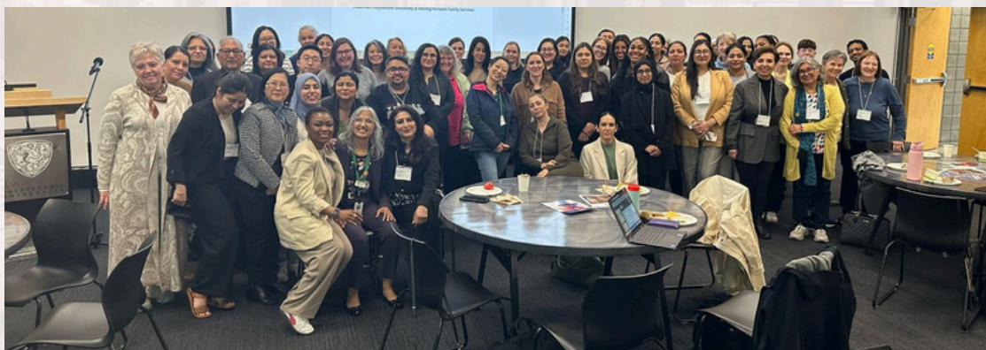
A GROUP PHOTOGRAPH OF PARTICIPANTS AT THE THE NEVR 15 TH ANNUAL TRAINING CONFERENCE, 2025