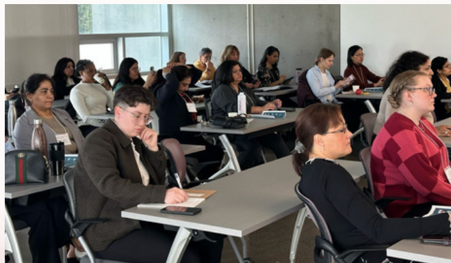
A CROSS SECTION OF PARTICIPANTS DURING ONE OF THE 20+ CONFERENCE WORKSHOPS